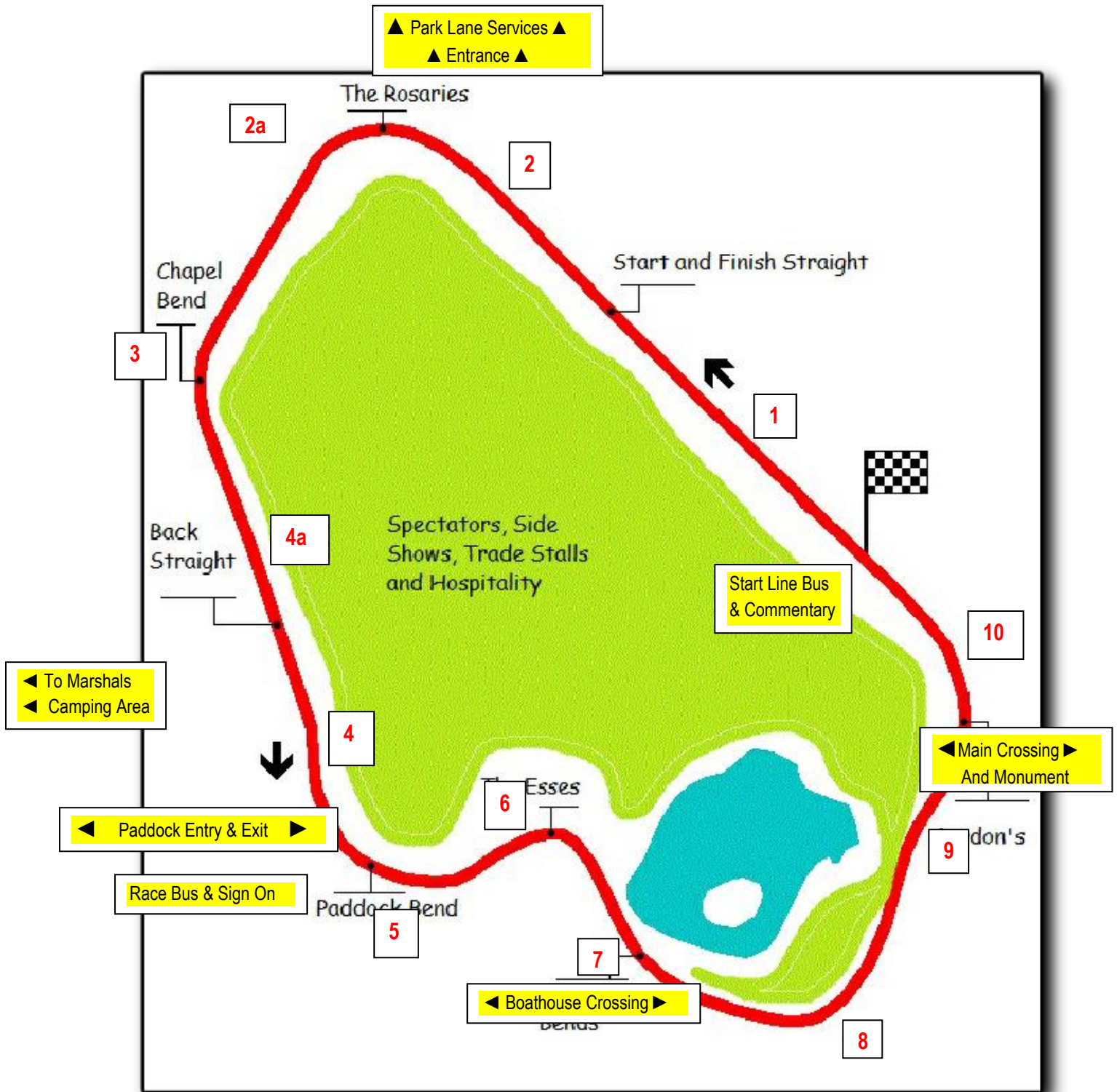
Circuit Diagram for Marshals Briefing Notes